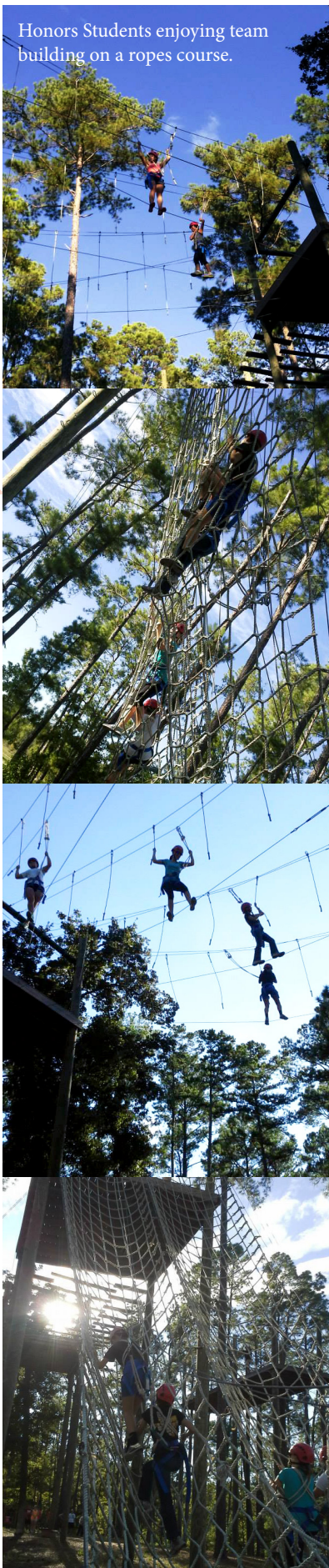
Honors Students enjoying team building on a ropes course.

The results of the seminar are often moving, and it's not uncommon for the class (speakers and students alike) to laugh and cry at different times during the semester. Journeys has often been described as the single best course students took while at SHSU.