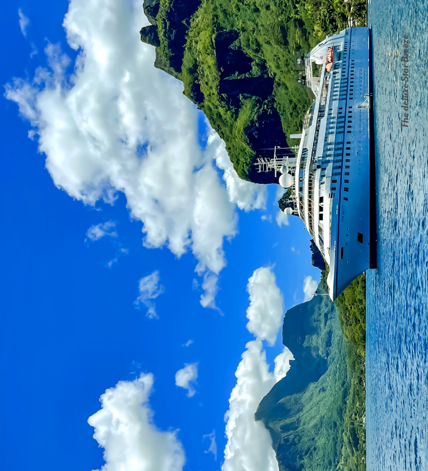
The deluxe Star Breeze

Early Booking Savings* available | Save $2,000 per couple!