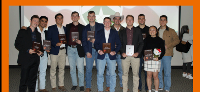
2024 Branch Reveal Ceremony Highlights Read more on pages 11-12