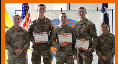
2024 Fall Awards Awards Ceremony Highlights Read more on page 10