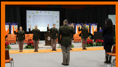
2024 Fall Commissioning Ceremony Highlights Read more on pages 3-5